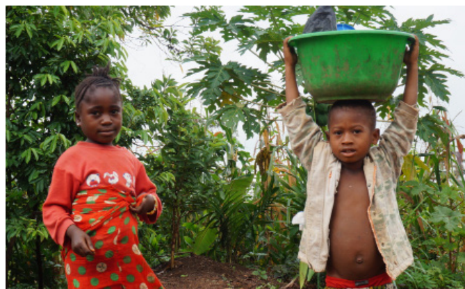
Sierra Leone: into the Ebola epicentre