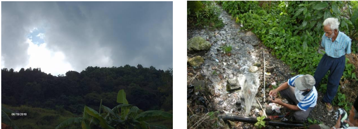
Figure 2 (a) Shadow of the rain area phenomena, (b) small creek to watering the farmland