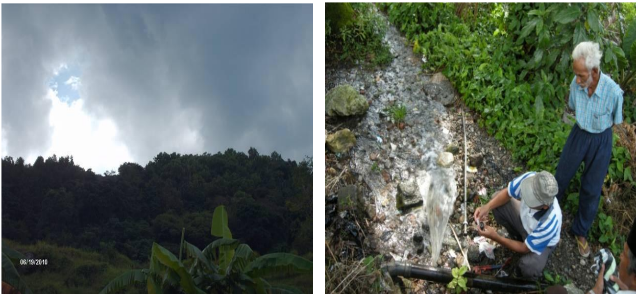
Figure 2: (a) Shadow of the rain area phenomena, (b) small creek to watering the farmland